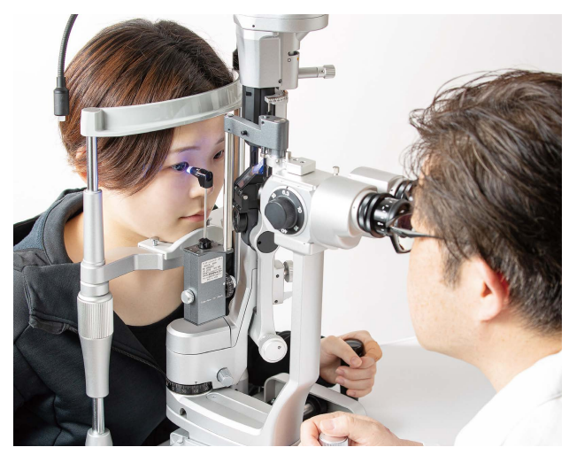
Compatible with all current TAKAGI slit lamps. An optional tonometer base is required for installation (Please see table on reverse side for information about tonometer bases that are compatible with each slit lamp model).