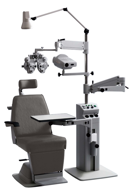
SN-500 combined with Ophthalmic Chair UN-15 * VT-5 View tester, CP-40 Chart projector, UN-15 Ophthalmic chair, U08-04 Projector arm, and U12-05 Slit lamp table top are separately available

•Description and appearance as detailed in this brochure may be subject to change as improvements